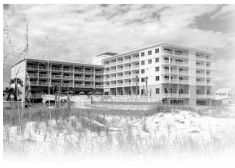
Springhill Suites on Pensacola Beach is only one of the many accommodation options offered by Highpointe Hotels.

Remember to ask for frequent stay rewards at all Highpointe hotels. Hilton Honors pays points and miles for every stay at Hampton Inn and Homewood